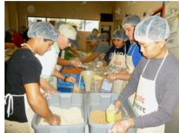
A youth group from Young Nak Presbyterian Church assembling food packages.

St. Philip has welcomed hundreds of volunteers from school, church, civic and business groups to serve with our members packing and boxing meals.