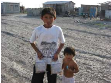
Children in Mexico holding the KAH food packets.

Acting as a part of the Mission Committee, an average of 10,000 meals a month are delivered by our volunteers to benevolence partners such as CCSC, Kid's Meals, and Bethel Ministry. More than 2 tons of food packages have been sent to orphanages and impoverished communities in Matamoros, Mexico.