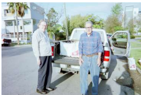
Loading up gifts to take to The Women's Home

The Women's Home is included in the annual St. Philip Mission Budget.