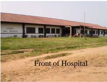
Front of Hospital

IMCK is a Christian primary health care facility and medical education center. Its services are centered at the Good Shepherd Hospital, which is a 140 bed facility about 10 miles outside of Kananga, in the Kasai Province of the DR Congo, and at PAX, a clinic located in the city of Kananga, that has 20 beds. General medicine, surgery, ophthalmology, pediatrics, gyn/obstetrics, dental services, radiology and lab services are provided. This faith-based organization has been in operation for almost 60 years. It is the largest Presbyterian affiliated hospital in the Democratic Republic of Congo.