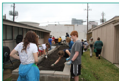
Picture of garden from a past Mission Day.