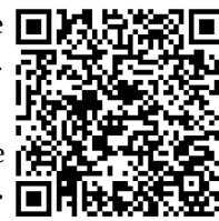
[ MAKE A CONTRIBUTION ]