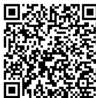
[ GUEST BOOK ]