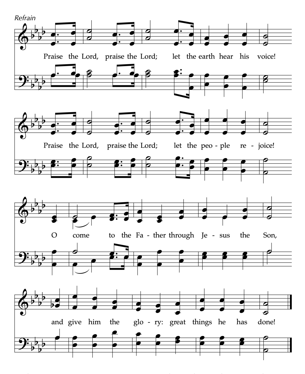
This American gospel song became popular in England in the late 19th century, then returned to this country in the mid-20th century with the Billy Graham crusades. Its continuing popularity may well be due to the freedom from subjective considerations in its praise of God.