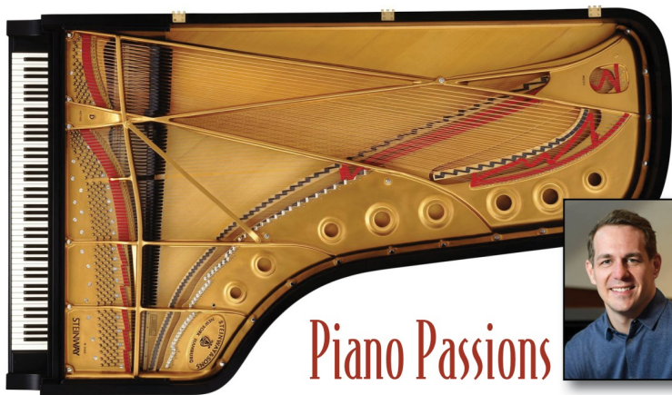
Steinway model D piano • 2002 (acquired 2018)

PROGRAM ② SUNDAY | AUGUST 18, 2019 | 2:00 p.m.