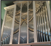
Paul Fritts Organ ◆ 2010

PROGRAM ③ SUNDAY | SEPTEMBER 15, 2019 | 2:00 p.m.