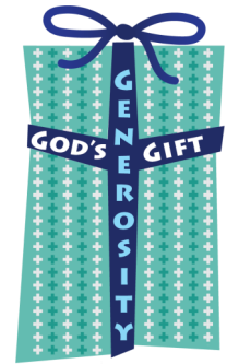
Gratitude Beyond Stewardship