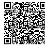
[PW FALL LUNCH]