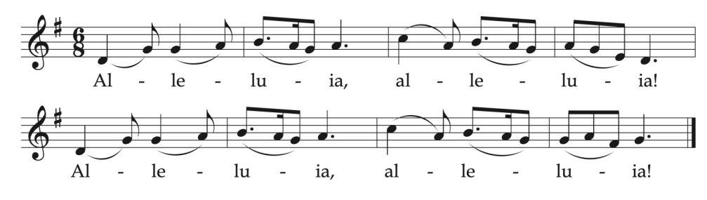
MUSIC: Fintan O'Carroll, 1981 ©